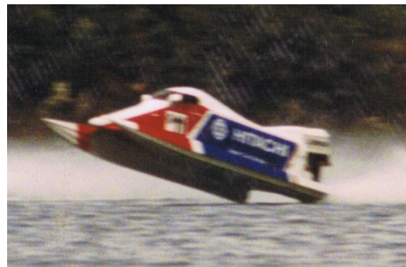
Hitachi 2 air borne

In 1987 he built an O Class fuller tunnel called Hitachi. He raced this boat until 1991 when he then purchased an Oz Burgess from Australia called Hitachi 2