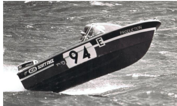
The first Scott Free

He brought his first power boat in 1974. a 13' Marlborough Dart with a 50HP Johnson on the back. This boat was called Sky High . Later he repowered it with a 70HP Johnson and renamed it Scott Free .